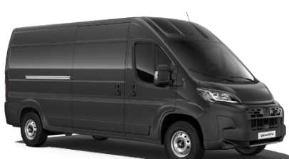
Nero Metallizzato (632) Metallic paint