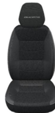
Crepe Colour Black