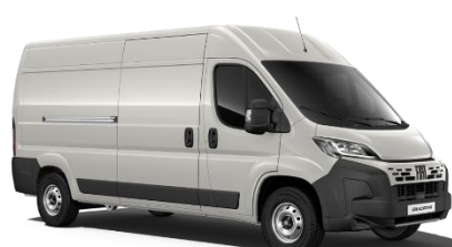
Grigio Expedition (676) Special Pastel Colour