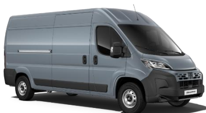
Grigio Ferro (691) Metallic paint