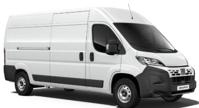
Bianco Pastello (549)