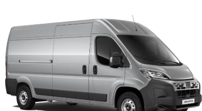
Grigio Artense (113) Metallic paint